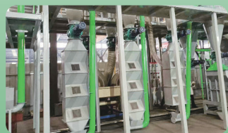
空气分离器 Air separator