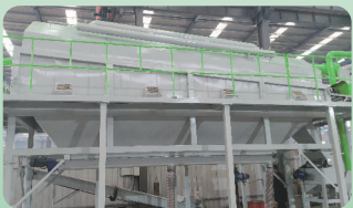
全封闭式滚筒筛 Fully sealed drum screen