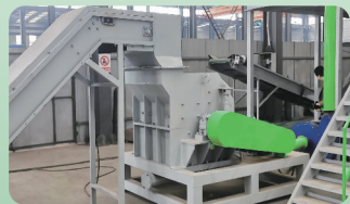
一级破碎 Primary crusher