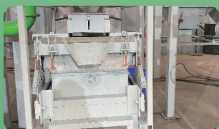
气流比重分选床 Air separation bed