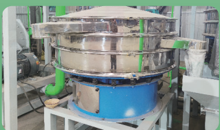
旋转振动筛 Rotary vibrating screen