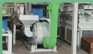
磨床 Grinding machine