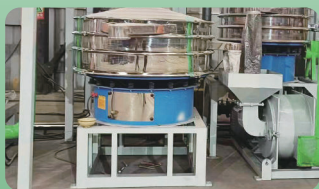
旋转振动筛 Rotary vibrating screen