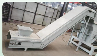
密封输送 Sealed Conveyor Belt