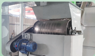
磁选机 Magnetic separator