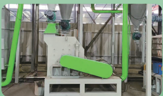
二级破碎 Secondary crusher